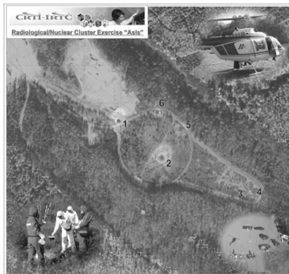
Natural hazards and emergency response

The Reducing Risks from Natural Hazards Program will advance the Government's commitment to mitigate the risk to Canadians from natural disasters. The principal long-term outcome of the department's natural hazards program is the reduction in the loss of life and