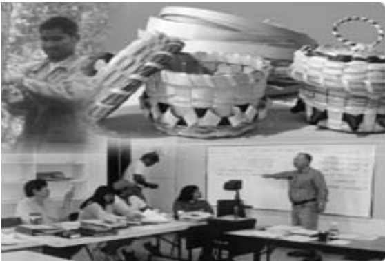
First Nations Forestry Program

plans for a renewed program to commence in 2007-08.