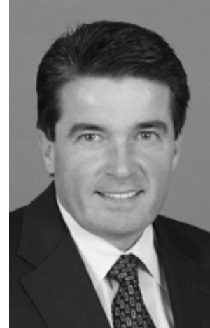
Gary V. Lunn Minister of Natural Resources

Natural resources are at the heart of Canada's economy, society and place in the world, particularly when it comes to energy production where we are fast becoming an energy superpower. We focus on core Government of Canada responsibilities, ensuring the responsible development and use of our energy, minerals, metals and forests. This work results in economic opportunities, as well as environmental and social benefits for present and future generations.